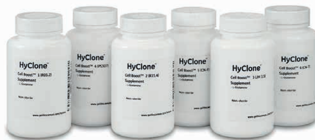
Fig 1. Cell Boost 2 Supplement is chemically defined and animal-derived component-free.